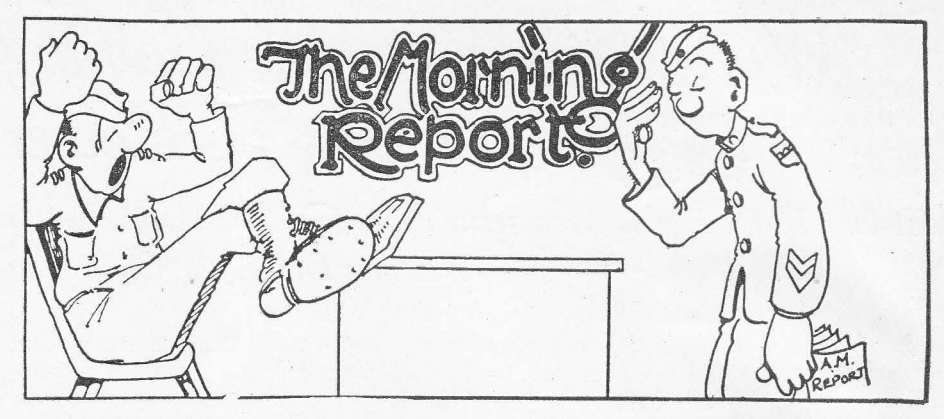
305TH AMMUNITION TRAIN IN MERCER COUNTY, PA.