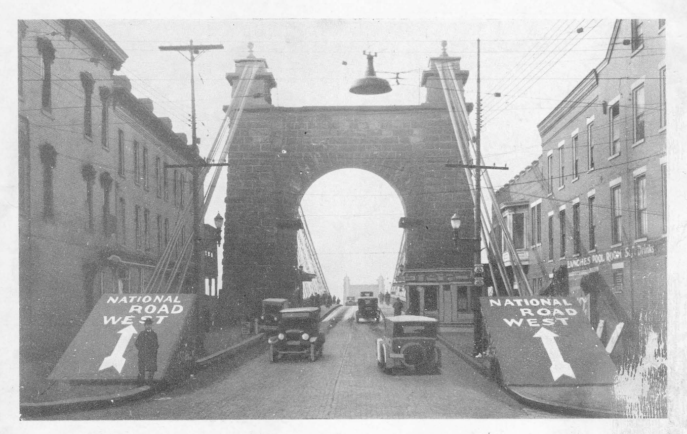
The suspension bridge at Wheeling, West Virginia, built in 1849, which until the completion of the Brooklyn Bridge, was the longest suspension bridge in the new world.

Wheeling's location in the Ohio Valley gives it distinctive advantage from the standpoint of accessibility by air, rail, river and highway transportation. These features for distribution link it closely with an immediate area of approximately 3,000 square miles. Wheeling as a trading center, therefore, serves a radius of 50 miles in practically every direction with its transportation facilities insuring overnight proximity to the eastern seaboard, the great lake section and the Mississippi Valley.