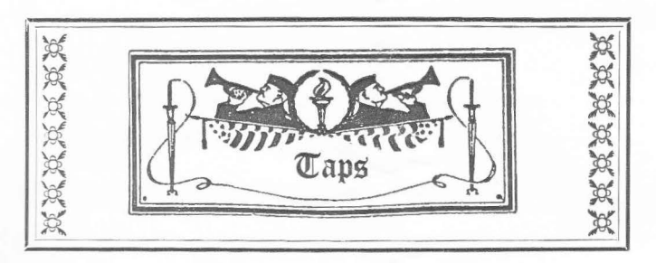
Fades the light and afar Goeth day, cometh night; and a star Leadeth all, speedeth all To their rest.

"Finally, what of those whose debt of sacrifice was paid in full in the twinkling of an eye? They seem near to us in this hallowed setting of the beautiful City of the Heroic Dead, and some way we cannot but feel that they are here in spirit and understand our deep appreciation and love for them, for which these simple memorial services are but a symbol. No man knows of a certainty why he is put into this world, nor for what reason he is taken therefrom, but we know that the world was made better by the lives of our dear departed comrades, and theirs should be the reward in Heaven".